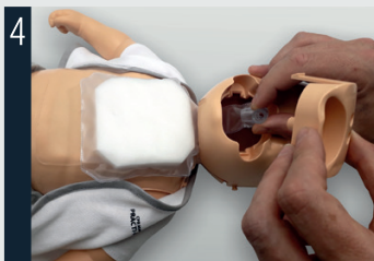
Connect the lung to the valve.