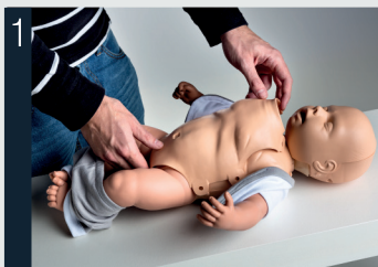
Remove the chest skin.