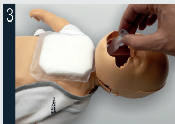
Move the lung to below the jaw.