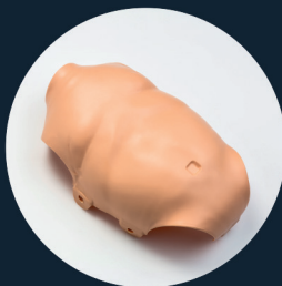
CHEST SKIN (Ref. Chest-PB)