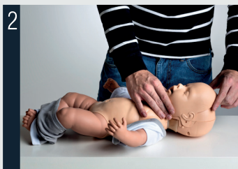
Remove the face skin.