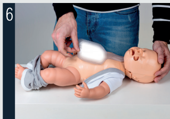
Place the lung on the chest