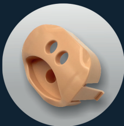
VALVE (Ref. SP-002 (PB))