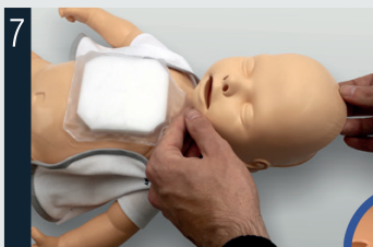
Fit the face skin, checking that the nose, mouth and upper tab are in the correct position.