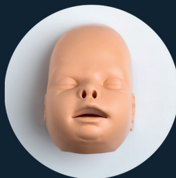
FACE SKIN (Ref. Face-PB)