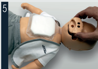
Make sure the valve is correctly attached to the head.