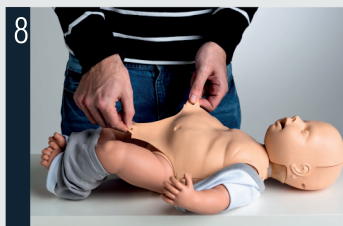
Place chest skin and attach to the studs.